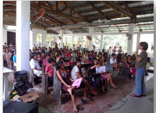
A BTS partner in a community CSAP session