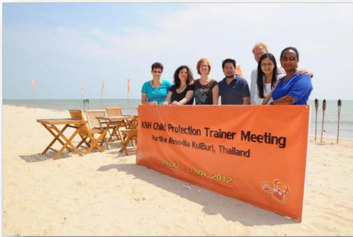
Stairway being involved in a major child protection training project by KNH Germany

Another milestone for Stairway is being tapped to conduct and assist in the development and delivery of a child protection policy capacity building program by KNH Germany. Because of this initiative, Stairway's animation Daughter is projected to be shown to several NGOs based in Asia, Africa and Latin America thru the said international partner. One of Stairway's advocacy and training officer